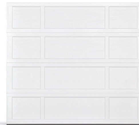
Combo Panel: 2296