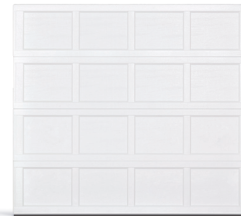
Short Panel : 2298