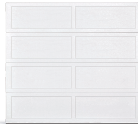
Long Panel : 2294